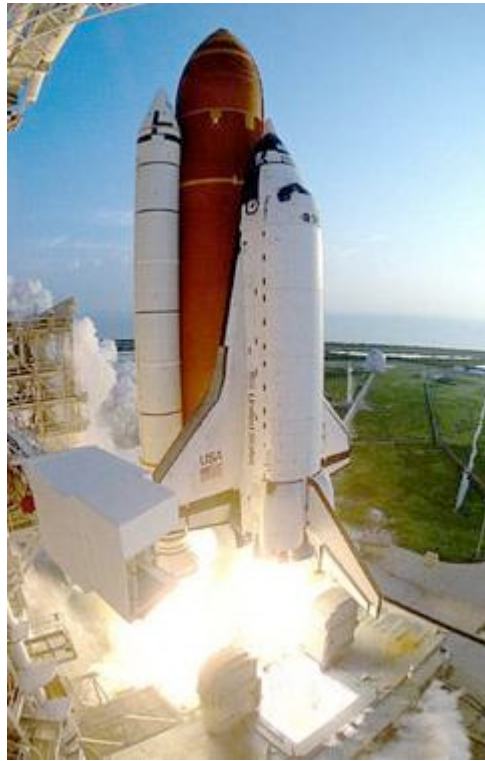
Figure 2. NASA's Space Shuttle Discovery

Liquid propellant is composed of liquid fuel and oxidizer. Rockets use many different combinations of these two substances. One example of liquid propellant is liquid hydrogen with liquid oxygen. The large, orange external fuel tank on NASA's space shuttle holds both of these two chemicals (see Figure 2).